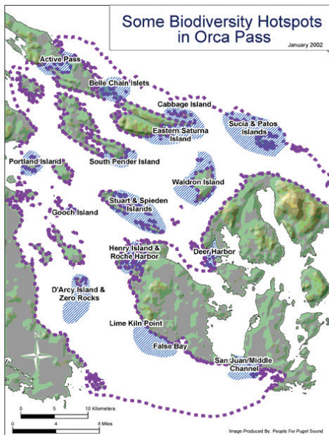
The Orca Pass International Stewardship Area was constituted in 1999 by individuals and non-government organizations on both sides of the American/Canadian boundary, to preserve the unique marine ecology of Boundary Pass.

comments that “Everyone asks that question when they first come to terms with the area we are talking about.” He then quickly explains that the process is very much in the consultative phase, saying that “While Canada is committed to moving in the direction of Marine Conservation Areas, nothing about the proposed Southern Strait of Georgia NMCA reserve is set in stone at this time. Parks Canada is committed to securing input from all stakeholders who are likely to be affected by any future legislation that will arise from the consultative process; this would include anyone with a long-term business interest in or affiliated with the designated area above, on or below the water surface as well as on or below the seabed.”