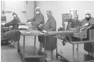
Canadian Food Inspection Approved Federal Plant #0986

Ocean Master Foods International is now a H.A.C.C.P. approved federally registered smoking facility adhering to the strictest world standards for smoked salmon. Owned and operated by past and current commercial fishermen.